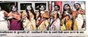
इग्नू का 33वां दीक्षांत समारोह पूरे भारत में ज्ञान दर्शन पैनल पर लाइव टेलीकास्ट किया गया।

84 छात्रों को वीसी ने इग्नू का 33वां दीक्षांत समारोह पूरे भारत में ज्ञान दर्शन पैनल पर लाइव टेलीकास्ट किया गया। कुल 9954 छात्रों ने डिग्री और डिप्लोमा के लिए अर्हता प्राप्त की। चौथे के कुलपति ने दिया अभ्युक्त।