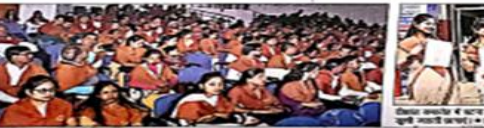
इग्नू का 33वां दीक्षांत समारोह पूरे भारत में ज्ञान दर्शन पैनल पर लाइव टेलीकास्ट किया गया।

पटना में दो छात्रों को मिला मोटोइडेल इग्नू का 33वां दीक्षांत समारोह पूरे भारत में ज्ञान दर्शन पैनल पर लाइव टेलीकास्ट किया गया। कुल 9954 छात्रों ने डिग्री और डिप्लोमा के लिए अर्हता प्राप्त की। चौथे के कुलपति ने दिया अभ्युक्त।