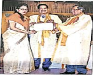
इग्नू का 33वां दीक्षांत समारोह पूरे भारत में ज्ञान दर्शन पैनल पर लाइव टेलीकास्ट किया गया।

84 छात्रों को वीसी ने इग्नू का 33वां दीक्षांत समारोह पूरे भारत में ज्ञान दर्शन पैनल पर लाइव टेलीकास्ट किया गया। कुल 9954 छात्रों ने डिग्री और डिप्लोमा के लिए अर्हता प्राप्त की। चौथे के कुलपति ने दिया अभ्युक्त।