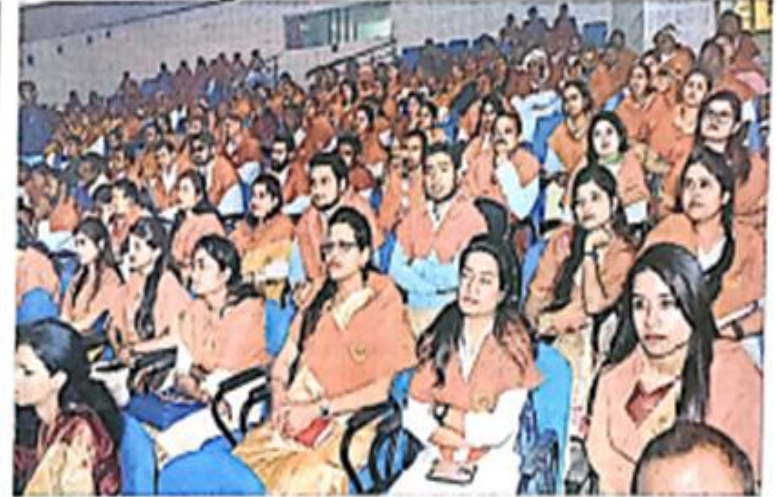
इग्नू के दीक्षांत समारोह में एक छात्रों को डिग्री और डिप्लोमा कोर्स के लिए जारी की गयी डिग्री को लेकर छात्रों को संबोधित किया।