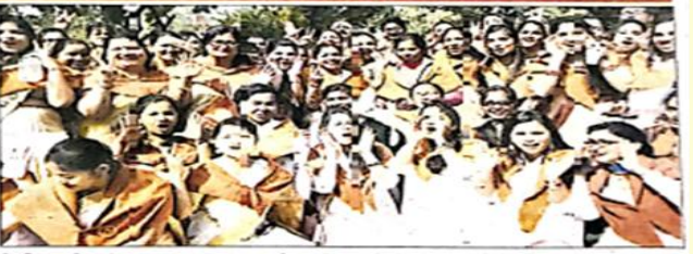
इग्नू का 33वां दीक्षांत समारोह पूरे भारत में ज्ञान दर्शन पैनल पर लाइव टेलीकास्ट किया गया।

समारोह किया गया। दिल्ली में आयोजित मुख्य समारोह में 231622 छात्रों को डिग्री और डिप्लोमा के लिए अर्हता प्राप्त की। चौथे के कुलपति ने दिया अभ्युक्त।