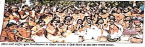
इग्नू का 33वां दीक्षांत समारोह पूरे भारत में ज्ञान दर्शन पैनल पर लाइव टेलीकास्ट किया गया।